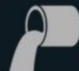
Underground drainage system