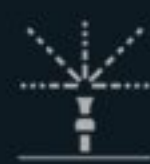
STP [Recycling drainage water to plantations]