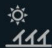
Compound wall with solar fencing