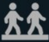
Walk / Jog Tracks