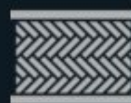
CC roads with foot paths